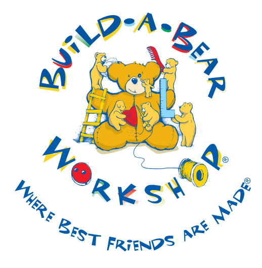
Build-A-Bear Workshop, Inc. 1954 Innerbelt Business Center Drive St. Louis, Missouri 63114